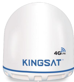
4G-LTE Antenna (Builtin 4G router)